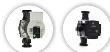
Wilo Yonos Para